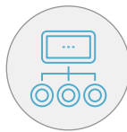
Organizational Structure, Staffing and Experience