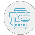
Research Administration Technology

This data helps institutions answer common questions like these: