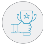
Post Award Processes