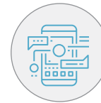
Research Administration Technology

This data helps institutions answer common questions like these: